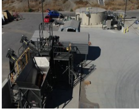
Food Waste Receiving In-Vessel Digester