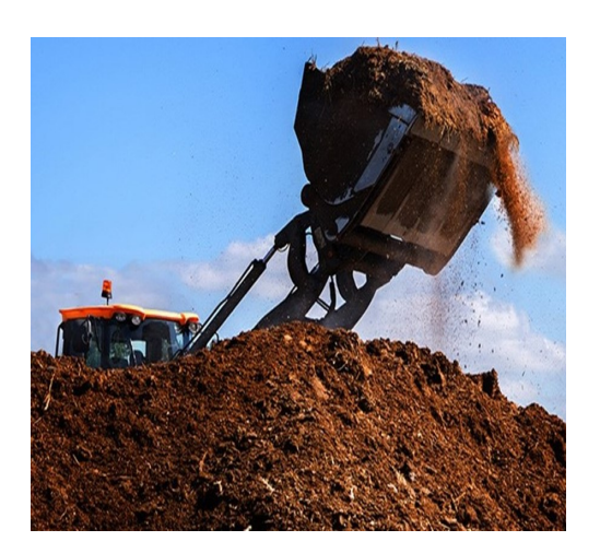
COMPOSTING FEATURED IN WASTE MAGAZINE