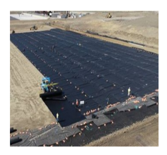
LANDFILL BIOGAS PROJECT