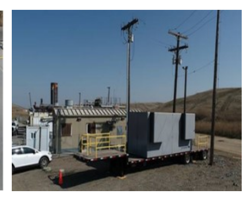
Renewable Electricity Generation