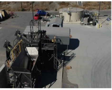
Food Waste Receiving In-Vessel Digester